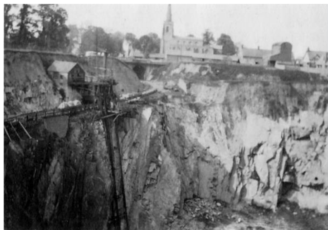
Photo 2 (1919) -In the background St. Michael's church is visible plus the tunnel that ran beneath New Road. Stoney Stanton was to become a veritable rabbit warren of quarries and tunnels within the village. In 1880 the quarry was 40 feet deep. By 1932 when the Carey Hill site closed, the quarry had reached a staggering depth of 160 feet.