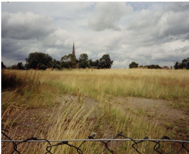
Photo 3 – today it is now filled in. Through all 3 photographs St. Michael's church is roughly viewed from the same perspective. Within a short distance of Sapcote, the village could boast 8 quarries – Clint Hill Calver Hill, Sapcote Leicester Road (Lovatt's), Granite Thorpe, Little Pit, Carey Hill, Top Pit and Lanes Hill. (Lanes Hill known as Stoney Cove today).

The quarries were mined for the fine grained compact syenite granite - an igneous rock which is not found elsewhere in Britain only here below Charnwood Forrest, with Sapcote being a southerly extension of this rock field. Its excellent qualities made it ideal for making road setts and kerbs which were very much in demand through England and farther afield.