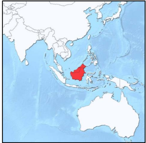
Borneo – Between India & Australia