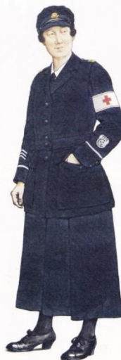
VAD ambulance driver, WWI