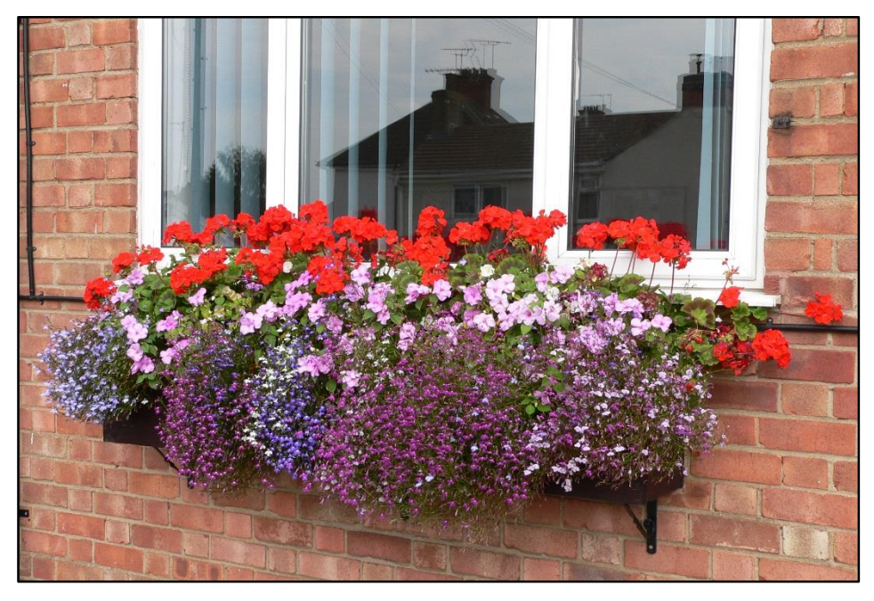
Page 22 Please support our advertisers