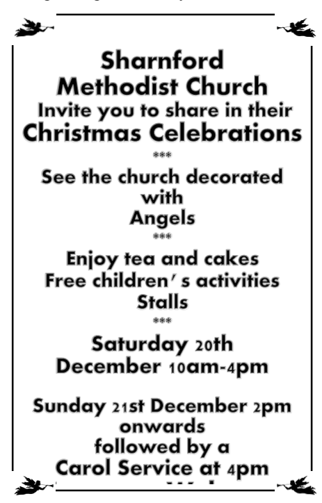
Page 19 Please support our advertisers

The Chapel will be open on Saturday December 20th between 10am and 4pm and on the Sunday from 2pm to 4pm. We invite you to come and see our decorations, the theme being "Angels" this year, there will be a children's activity corner and seasonal