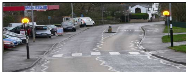
These photos show the before and after installation of the new Zebrite Lights

We are still keeping an eye on the volume and speed of traffic through the village, and keep pushing for a bypass, although we are aware of the shortage of finance for such projects.