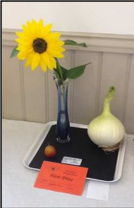
First prize in the 1 flower, 1 veg and 1 fruit section