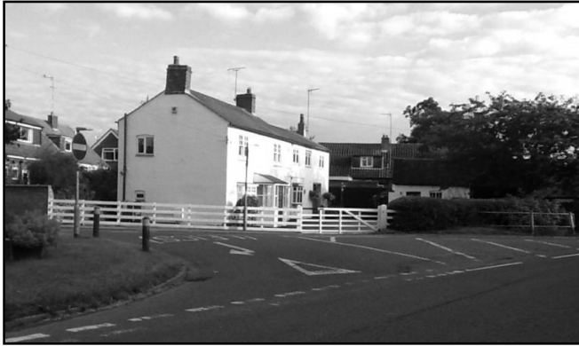
The photo to the left is 26 Coventry Road photographed 14 Sept 2013.