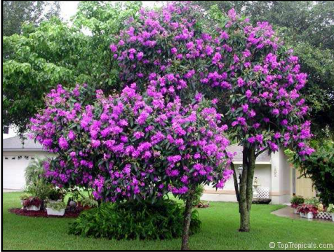
A Tibouchina in full bloom

I know you have had quite a mild winter. Well, we are having a steaming hot summer here in Durban. Westville, where I live, is a little inland and on a hill so we do get some breeze, which is a relief. Westville is a beautiful suburb, full of trees and shrubs. Last month the jacarandas were in full bloom. The beautiful lilac-blue blossom comes out before the leaves so the valleys are filled with blue trees, which is quite an amazing sight.