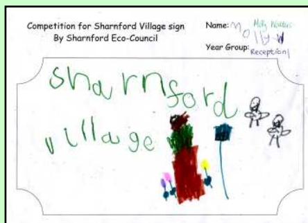
Molly Walters - Reception