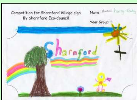
Hanah Harvey-Rowley – Class 5