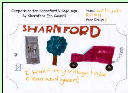
Callum Riley – Class 1