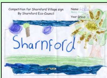
Hollie Harvey-Rowley – Class 2