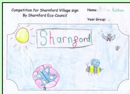
Alisha Reddam – Class 4